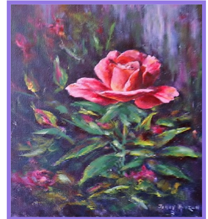
Artwork courtesy of Jerry Hosten

WE ARE PLEASED TO ANNOUNCE OUR TWO DAY OUTDOOR ART FESTIVAL, SHOWCASING FINE ORIGINAL ART AND CRAFTS AT PRAIRIE CROSSING.